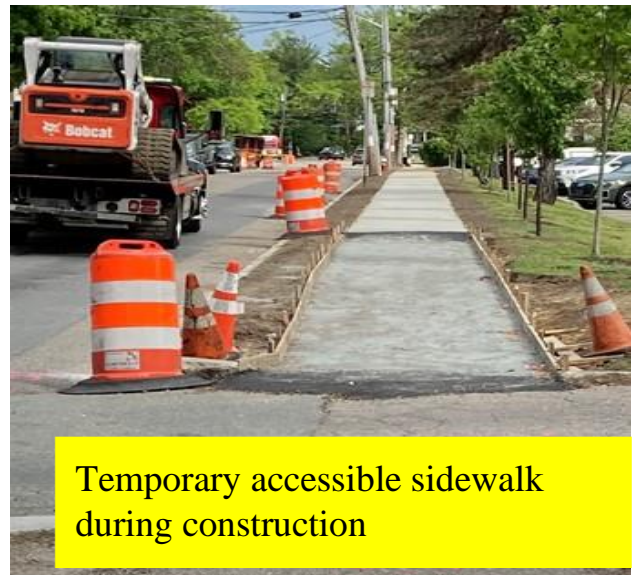
Temporary accessible sidewalk during construction