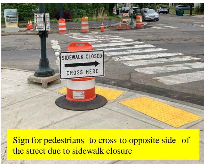
Sign for pedestrians to cross to opposite side of the street due to sidewalk closure