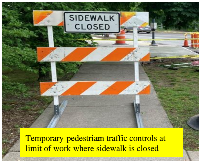
Temporary pedestrian traffic controls at limit of work where sidewalk is closed