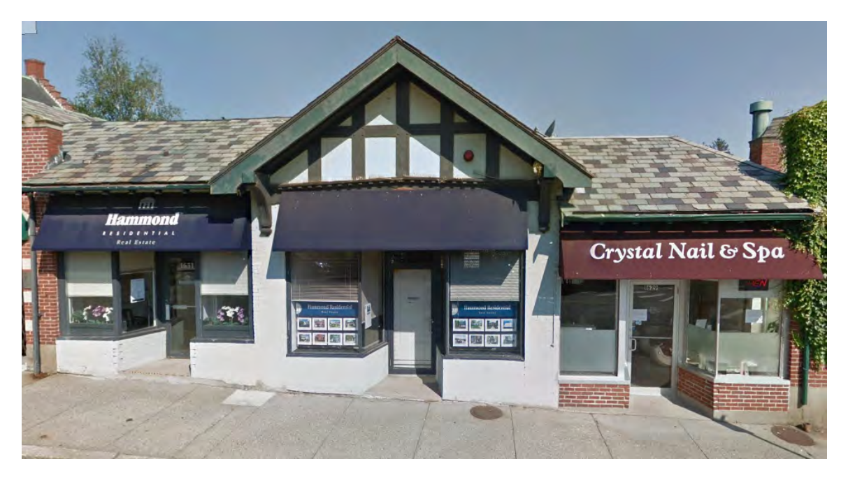
Left to right: Nos. 1633, 1631, and 1629 Beacon Street, from July 2017 Street View image.