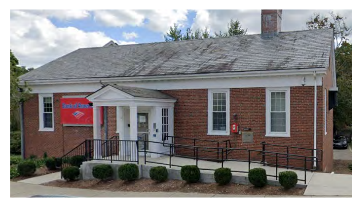
No. 466 Woodward Street, from September 2019 Street View image.