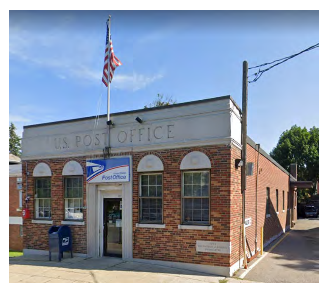
Waban Branch Post Office, 83 Wyman Street, from August 2019 Street View image.