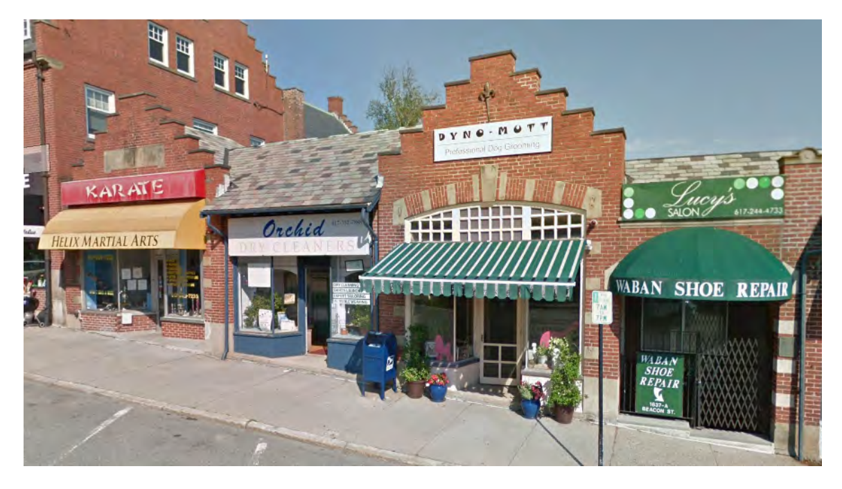
Left to right: Nos. 1639, 1637, and 1635 Beacon Street, from July 2017 Street View image. Stairs to right of No. 1635 go to Nos. 1637a and 1635a on the basement level.

Left to right: Nos. 1651, 1649, 1645, and 1641 Beacon Street, from July 2017 Street View image. Doorways on either side of No. 1645 go to stairs to second floor, Nos. 1647 and 1643.