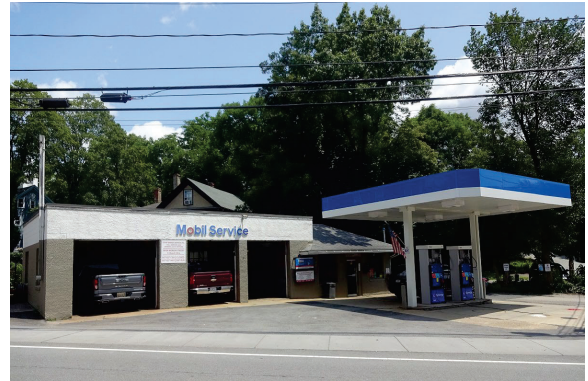
1010 Chestnut Street