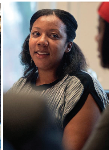
Above Left to Right: REACH Beyond Domestic Violence; Community Day Center of Waltham; Brookline Community Mental Health Center