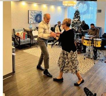
Above (clockwise, from top-left): John M. Barry Boys and Girls Club; The Carroll Center for the Blind; and Newton Community Development Foundation (NCDF)