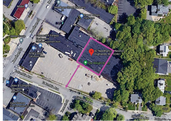
*Current GoPuff location on Needham Street