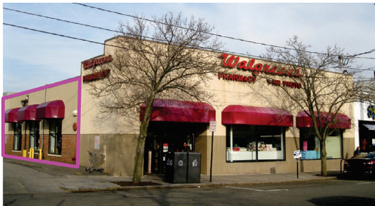
Use located at least 16 feet from the street-facing facade

Prohibit in Business 1 and Business 2 districts or allow subject to design standards?