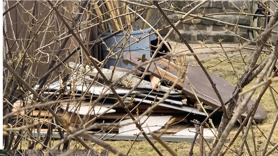
The old backboard and targets!