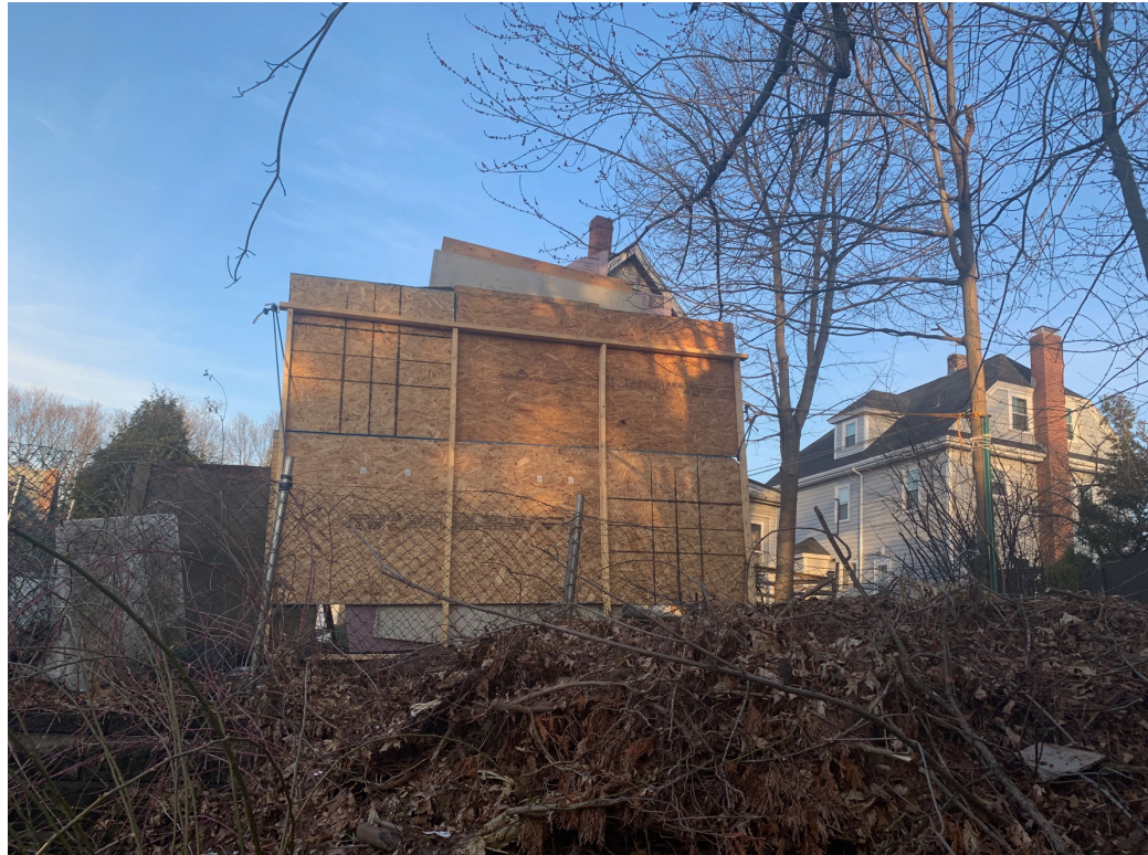
New Targets built within the past 30 days