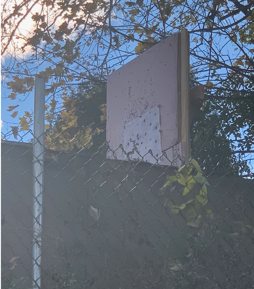
The first targets built and when you zoom into the picture you can see how sporadic the shot are and can guarantee the stray pellets have crossed into our properties. Built before the 19 th Nov. 2021