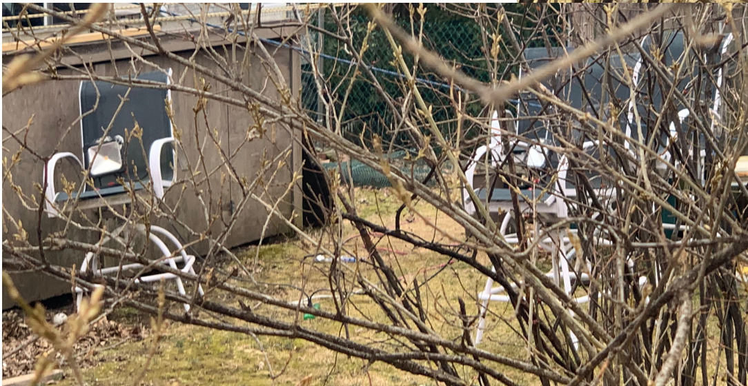
The spotlights he uses to shoot at night.