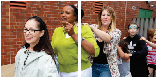
*Above: Newton Community Development Foundation

Financial support for programs that directly provide stability across the lifespan for Newton’s low- to moderate-income population.