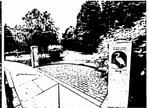
Needham trail entrance at 2 nd Avenue and 4 th Avenue

Work to date has included a survey conducted by DCR, a 2021 feasibility study, and community engagement including discussions with nearby property owners, Needham representatives, and the public. Please see this project page for more information.