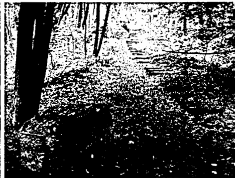
Right of way seen from Charles River Reservation path, looking east