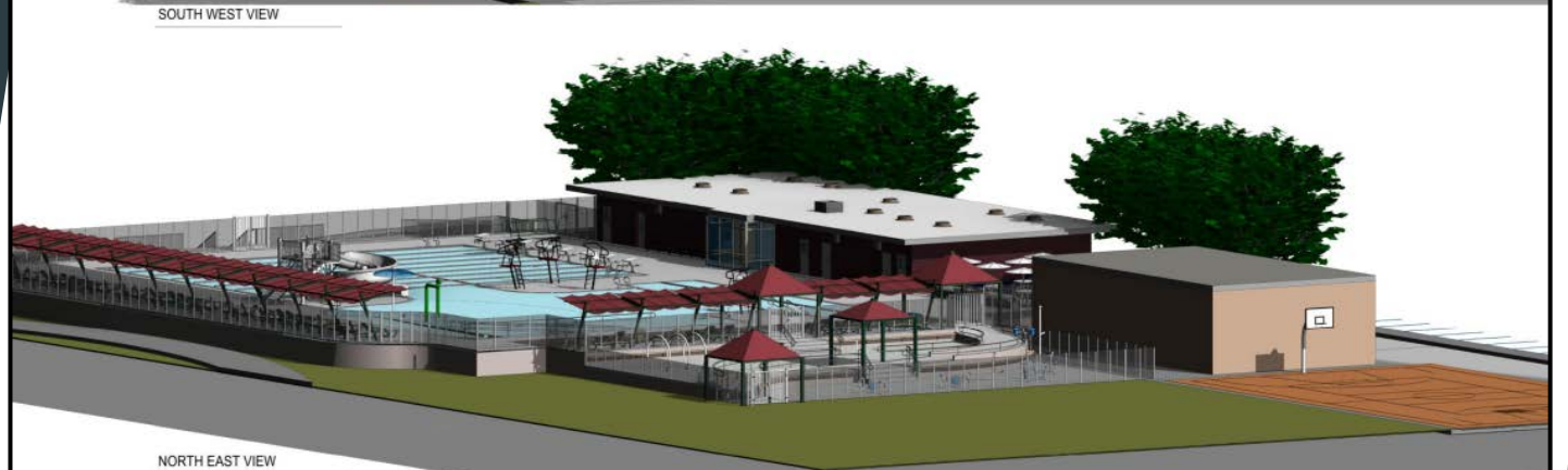
NORTH EAST VIEW