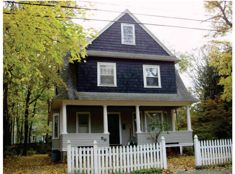
50 Elmore Street