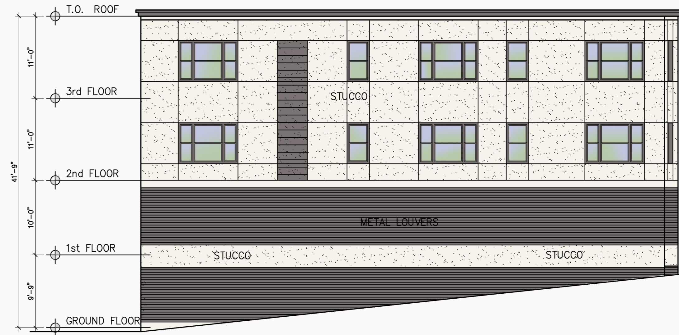
4 A9 PROPOSED EAST ELEVATION 1/8" = 1'-0"

PAUL R. LESSARD • REGISTERED ARCHITECT • 13 STATION ROAD, SALEM, MA 01970 (978) 210-1960 paul@paularchitect.com