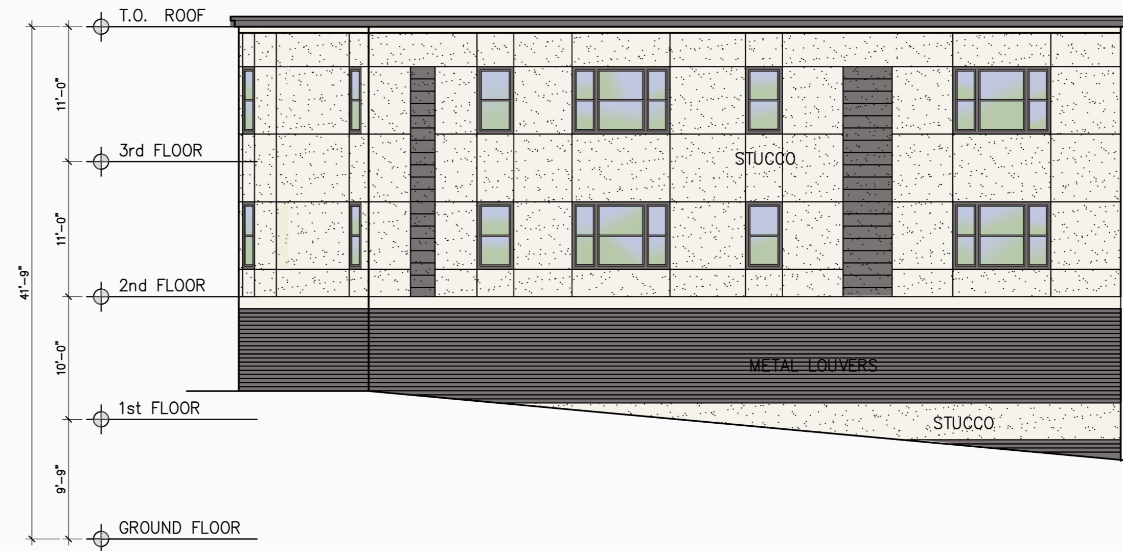
2 A9 PROPOSED WEST ELEVATION 1/8" = 1'-0"