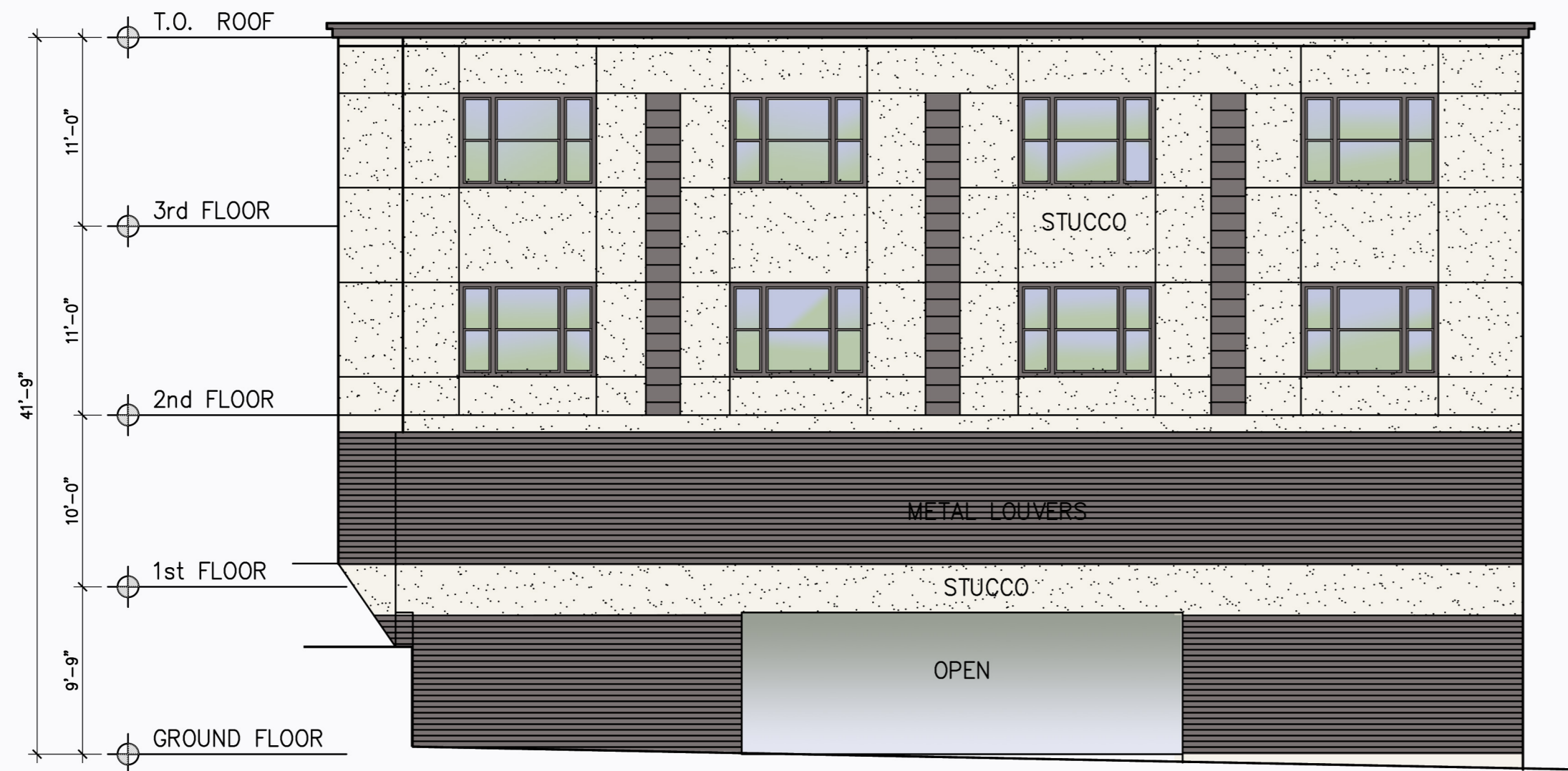
1 A9 PROPOSED SOUTH ELEVATION 1/8" = 1'-0"