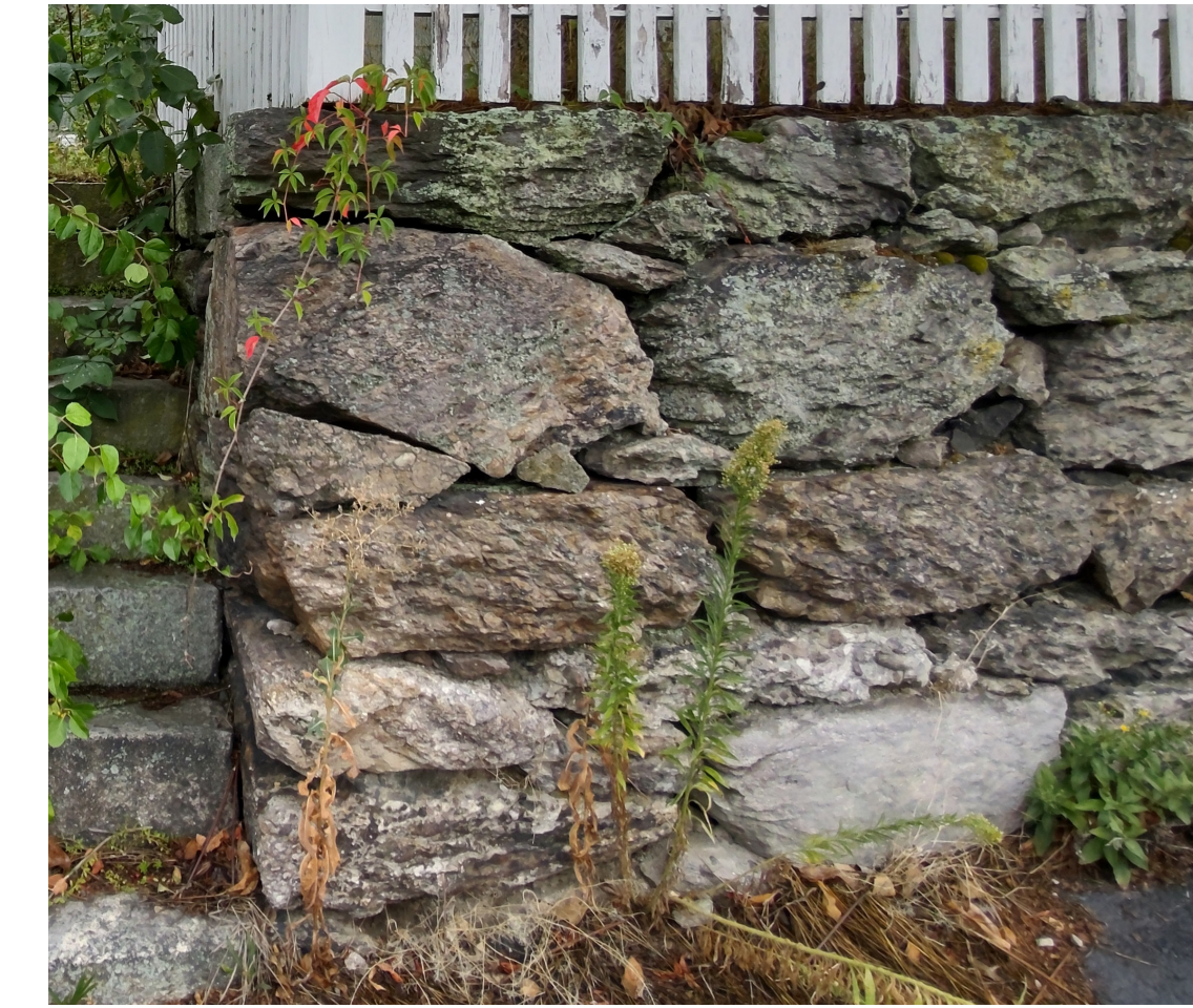
Reuse Ex. Wall Stone for Site Walls