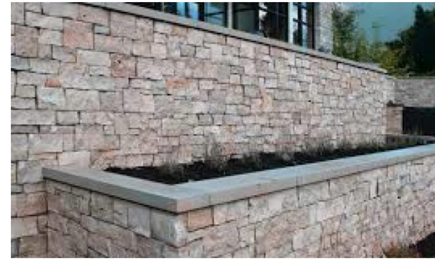
Ledge stone Thin Veneer Retaining Wall