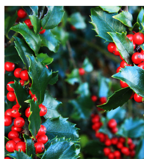
Ilex meserveae 'China Girl' China Girl Blue Holly (IM)