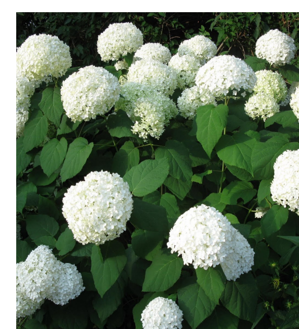
Hydrangea arborescens 'Annabelle' Annabelle Hydr. (HA)