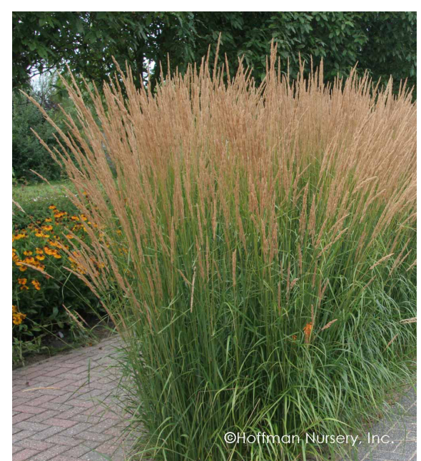
Calamagrostis x acutiflora 'Karl Foerster' Karl Foerster Feather Reed Grass (ck)