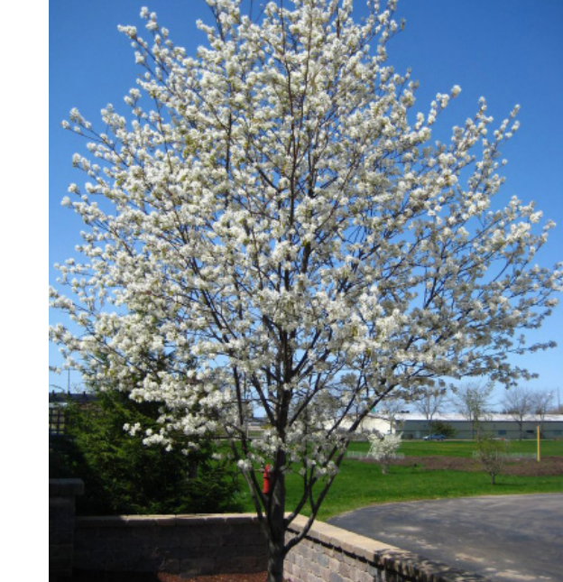
Amelanchier x grandiflora 'Autumn Brilliance' Serviceberry (AG)