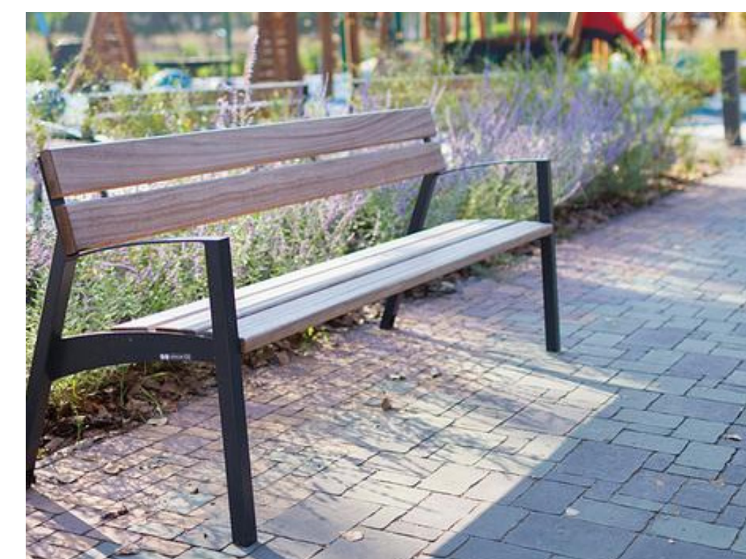
Vera by mmcite