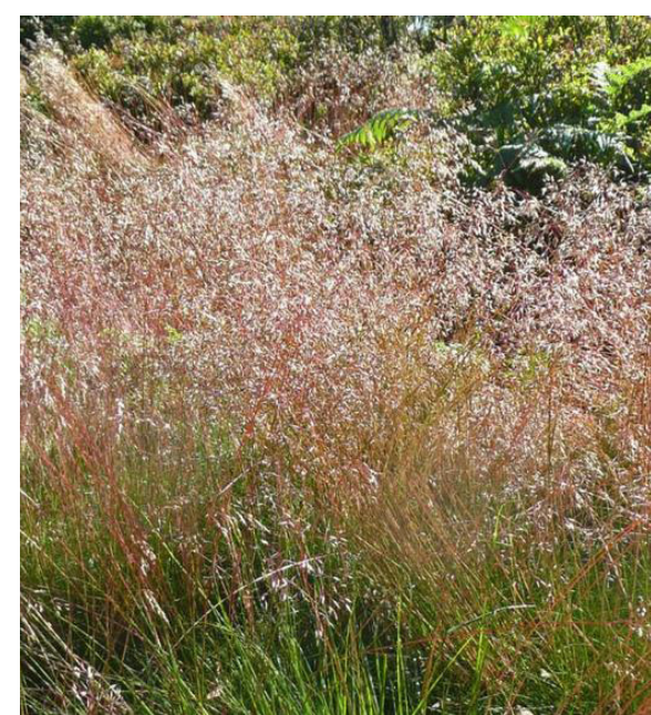
Descampsia flexuosa wavy hair grass (df)