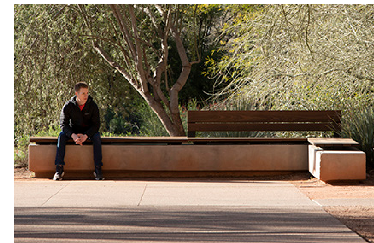
Link by Landscape Forms