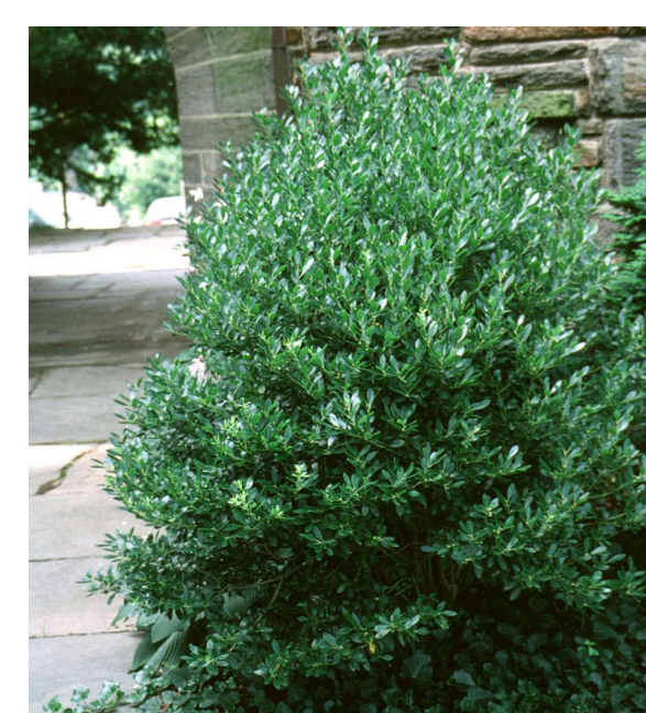
Ilex glabra 'Densa' Inkberry (IG)