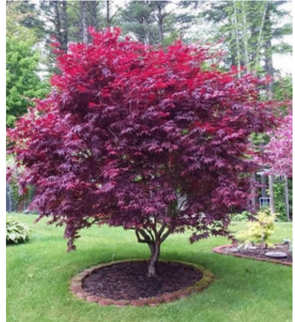
Acer palmatum 'Bloodgood' Japanese Maple Cultivar (AP)