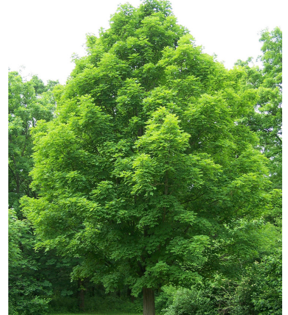
Acer saccharum Sugar Maple (AS)