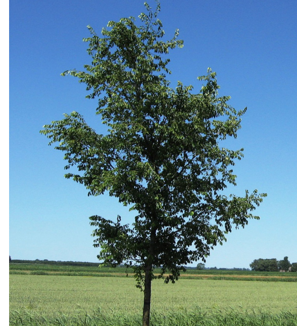
Ulmus americana 'Homestead' Homestead Elm (UA)