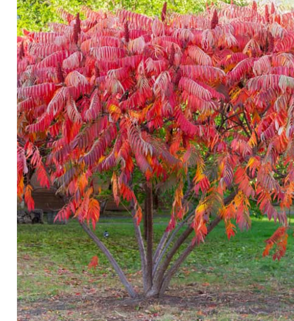
Rhus typhina Sumac (RT)