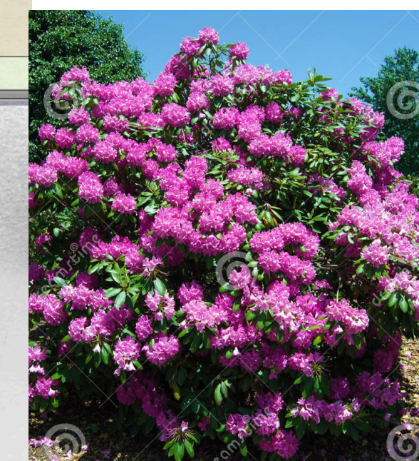
Rhododendron catawbiense Catawba Rhododendron (RC)