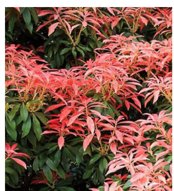
Pieris japonica 'Red Head' Japanese Pieris (PJ)