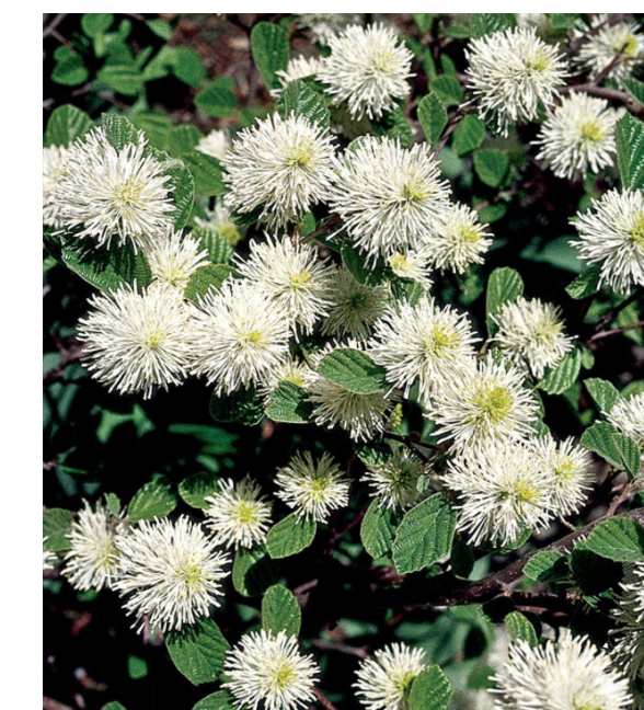
Fothergilla gardenii Fothergilla (FG)