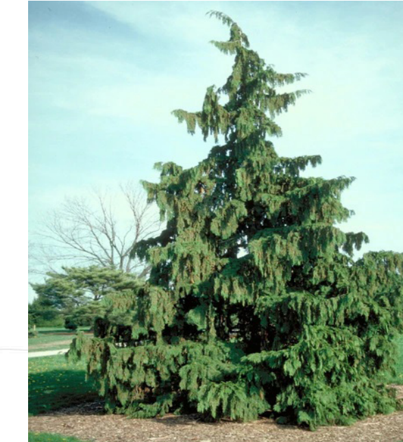
Chamaecyparis obtusa 'Pendula' Weeping False Cypress (CP)