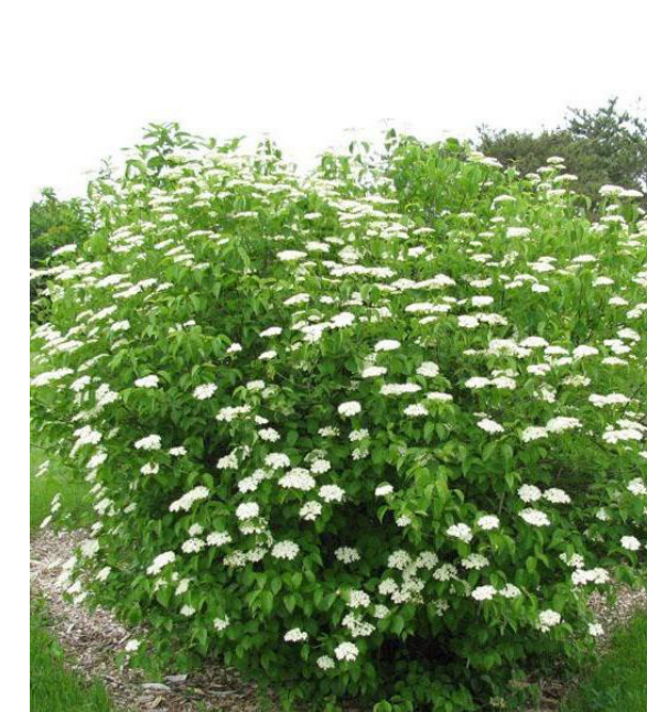
Viburnum dentatum Arrowwood Viburnum (VD)