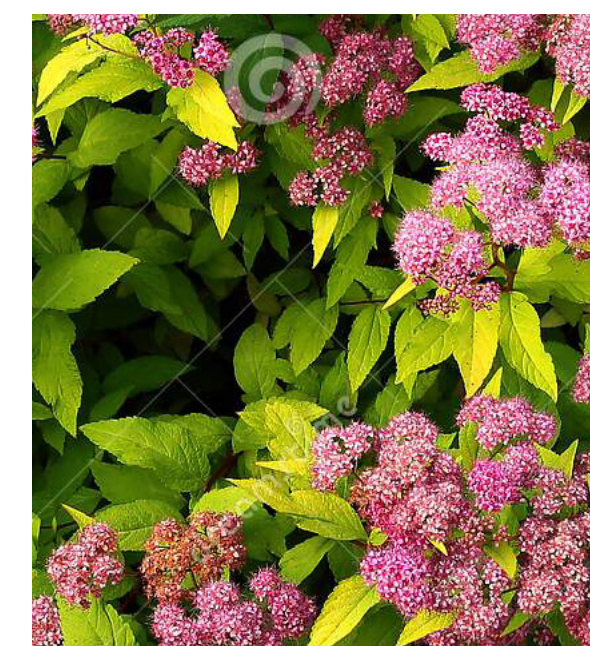
Spiraea japonica Japanese Meadowsweet (SJ)