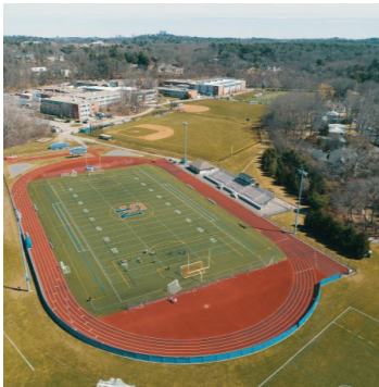
NSHS WINKLER STADIUM (2023)