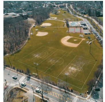
ALBEMARLE CRAFTS ST FIELD (2023-2024)