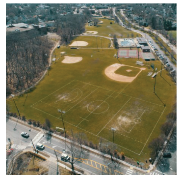
ALBEMARLE LIGHTS (2023-2024)