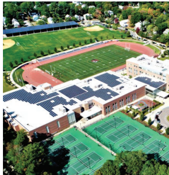
NNHS TIGER STADIUM (2024)