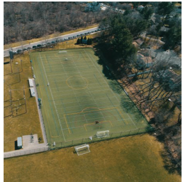
NSHS BRANDEIS RD FIELD (2023)