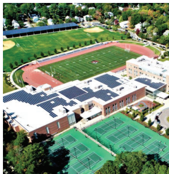
NNHS TIGER STADIUM LIGHTS (2023)