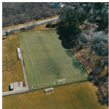
NSHS BRANDEIS RD FIELD LIGHTS (2022)