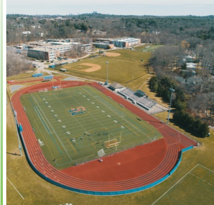
NSHS WINKLER STADIUM LIGHTS (2020)