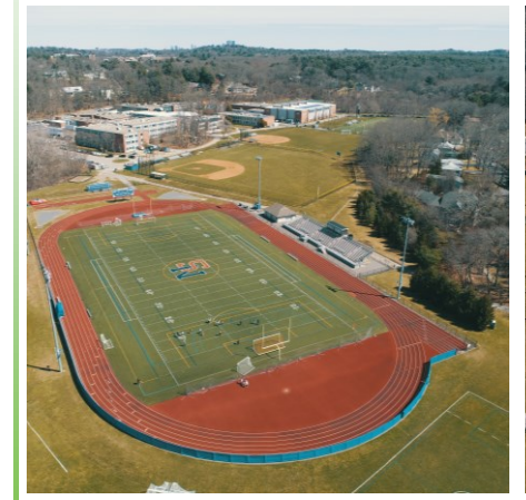
NSHS WINKLER STADIUM (2023)