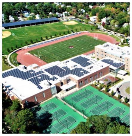
NNHS TIGER STADIUM LIGHTS (2023)