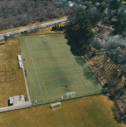
NSHS Brandels RD FIELD (2023)