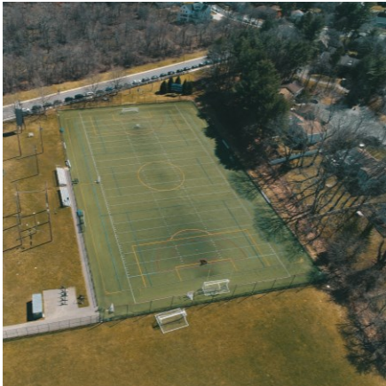
NSHS Brandels Rd Field Lights (2022)