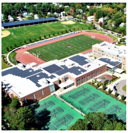
NNHS TIGER STADIUM (2024)