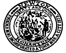
Ruthanne Fuller Mayor

FIRE DEPARTMENT HEADQUARTERS 1164 Centre Street, Newton Center, MA 02459-1584 Chief: (617) 796-2210 Fire Prevention: (617) 796-2230 FAX: (617) 796-2211 EMERGENCY: 911