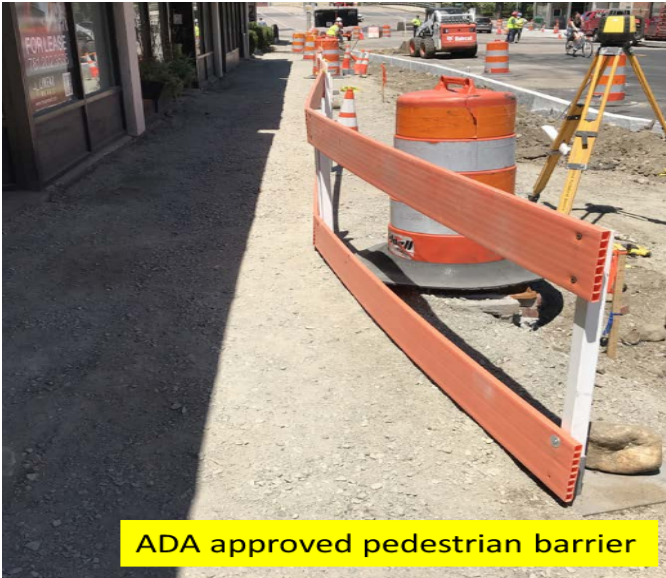
ADA approved pedestrian barrier