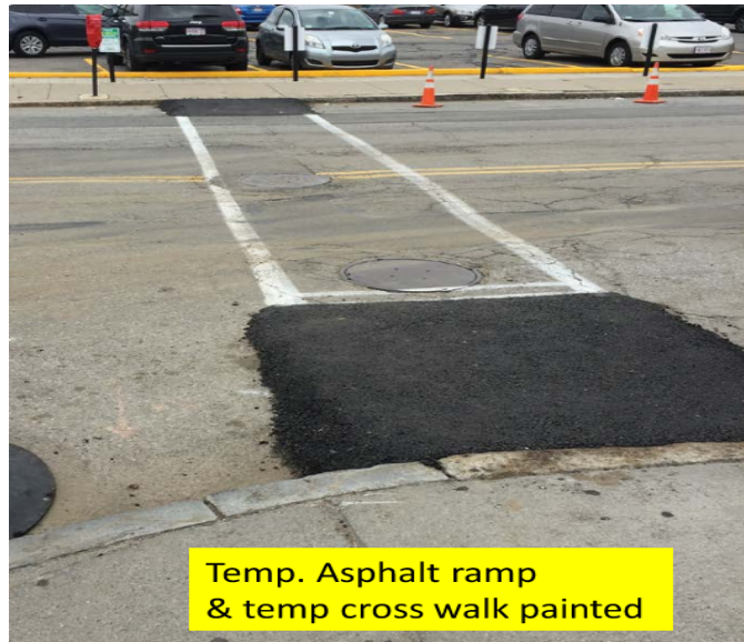
Temp. Asphalt ramp & temp cross walk painted