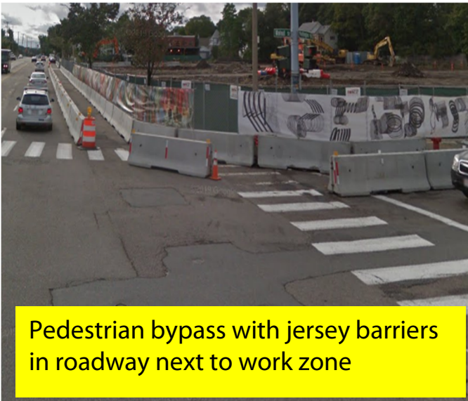
Pedestrian bypass with jersey barriers in roadway next to work zone