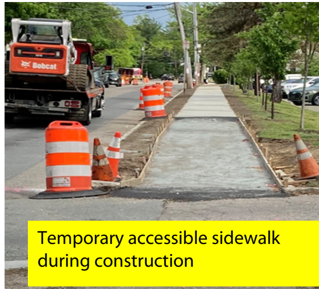
Temporary accessible sidewalk during construction