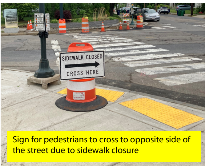
Sign for pedestrians to cross to opposite side of the street due to sidewalk closure