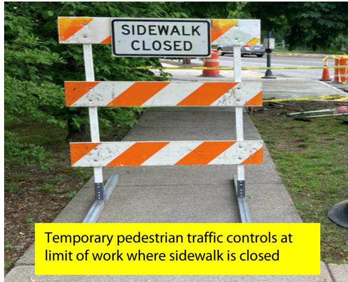
Temporary pedestrian traffic controls at limit of work where sidewalk is closed