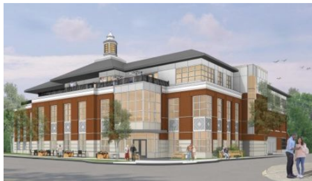
(Photo: Architect rendering of NewCAL, our new senior center, on Walnut Street in Newtonville.)