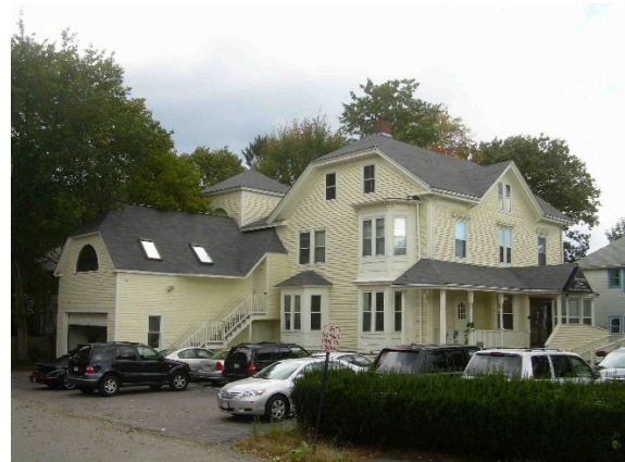
1349 Centre Street

The purpose of this memorandum is to provide the City Council and the public with technical information and planning analysis which may be useful in the special permit decision making process of the City Council. The Planning Department's intention is to provide a balanced view of the issues with the information it has at the time of the public hearing. There may be other information presented at or after the public hearing that the Land Use Committee of the City Council will want to consider in its discussion at a subsequent Working Session.