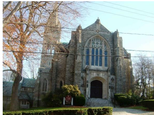
60 Highland Street

The purpose of this memorandum is to provide the City Council and the public with technical information and planning analysis conducted by the Planning Department. The Planning Department's intention is to provide a balanced review of the proposed project based on information it has at the time of the public hearing. Additional information about the project may be presented at or after the public hearing for consideration at a subsequent working session by the Land Use Committee of the City Council.