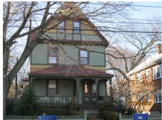
373 Lexington Street

The purpose of this memorandum is to provide the City Council and the public with technical information and planning analysis conducted by the Planning Department. The Planning Department's intention is to provide a balanced review of the proposed project based on information it has at the time of the public hearing. Additional information about the project may be presented at or after the public hearing for consideration at a subsequent working session by the Land Use Committee of the City Council.