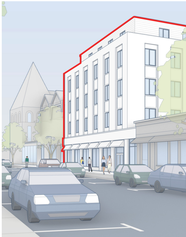
Hypothetical VC3 building.