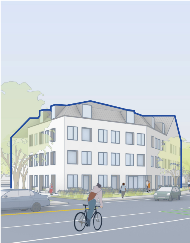
Hypothetical VC2 building.