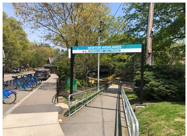
Bluebikes available at the Newton Highlands T Stop.