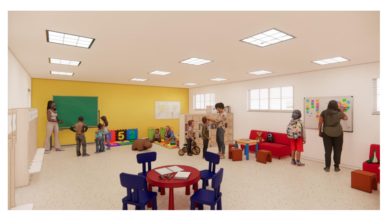
Proposed Indoor playspace/learning