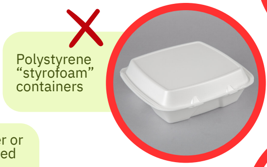
Polystyrene "styrofoam" containers