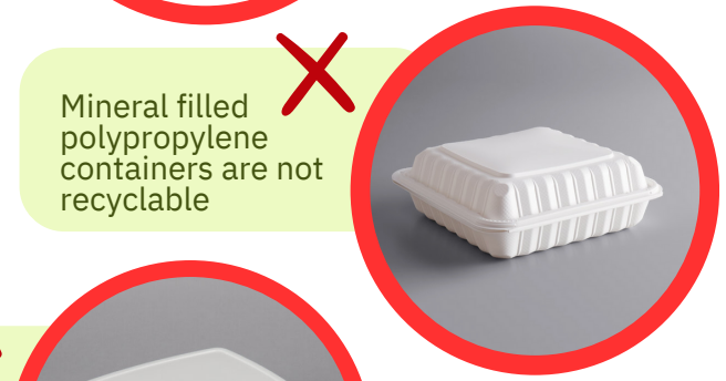
Mineral filled polypropylene containers are not recyclable