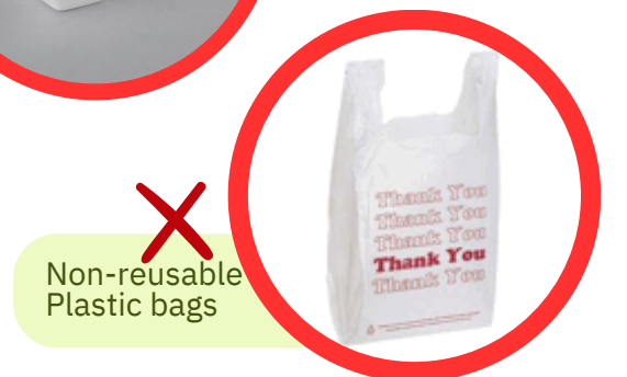
Non-reusable Plastic bags