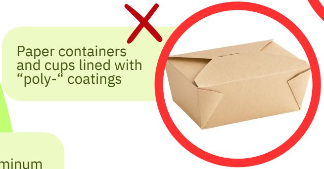
Paper containers and cups lined with "poly-" coatings