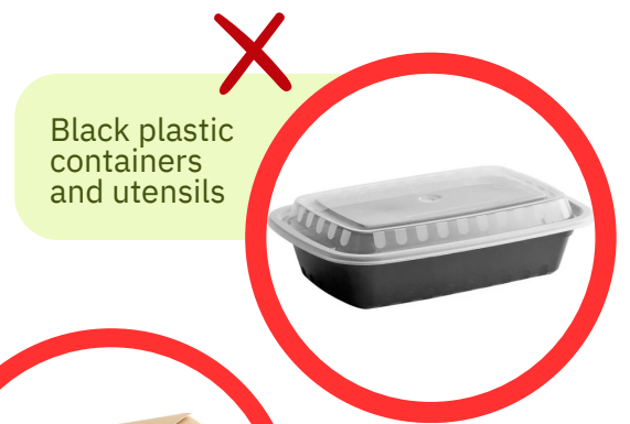
Black plastic containers and utensils