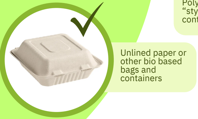
Unlined paper or other bio based bags and containers