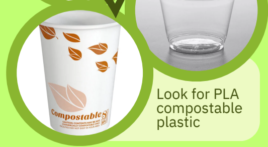
Look for PLA compostable plastic