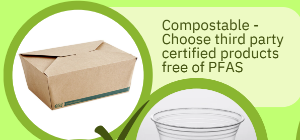
Compostable - Choose third party certified products free of PFAS