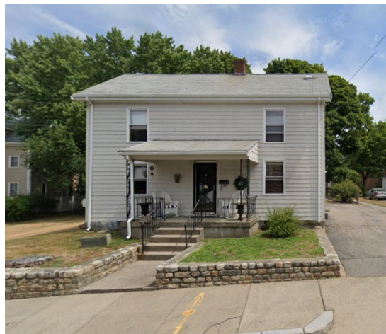
236 Chapel Street

The purpose of this memorandum is to provide the City Council and the public with technical information and planning analysis conducted by the Planning Department. The Planning Department's intention is to provide a balanced review of the proposed project based on information it has at the time of the public hearing. Additional information about the project may be presented at or after the public hearing for consideration at a subsequent working session by the Land Use Committee of the City Council.