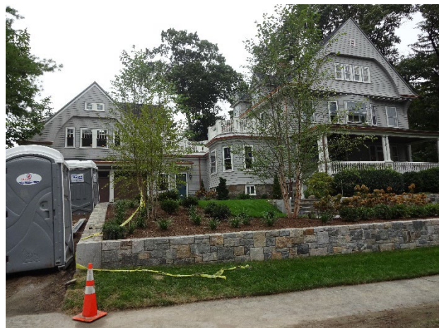
161 Pine Ridge Rd.

The purpose of this memorandum is to provide the City Council and the public with technical information and planning analysis which may be useful in the special permit decision making process of the City Council. The Planning Department's intention is to provide a balanced view of the issues with the information it has at the time of the public hearing. There may be other information presented at or after the public hearing that the Land Use Committee of the City Council will want to consider in its discussion at a subsequent Working Session.