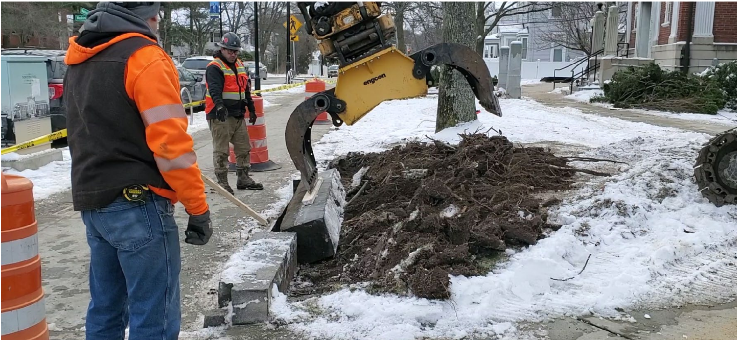
Above - The crews are delicately removing granite elements from around the site. Below the chandelier is being carefully removed for restoration.