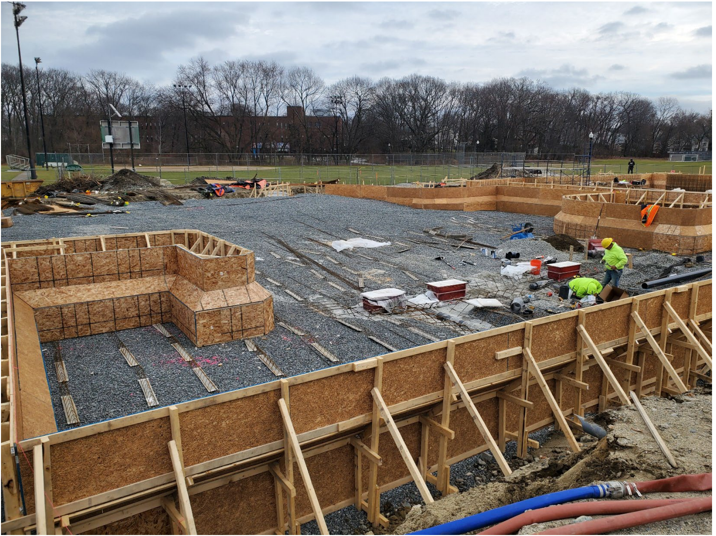
The framing crews are already forming the zero-entry recreational pool. Once the competition pool concrete pours are complete, we'll start pouring concrete for the recreational pool.