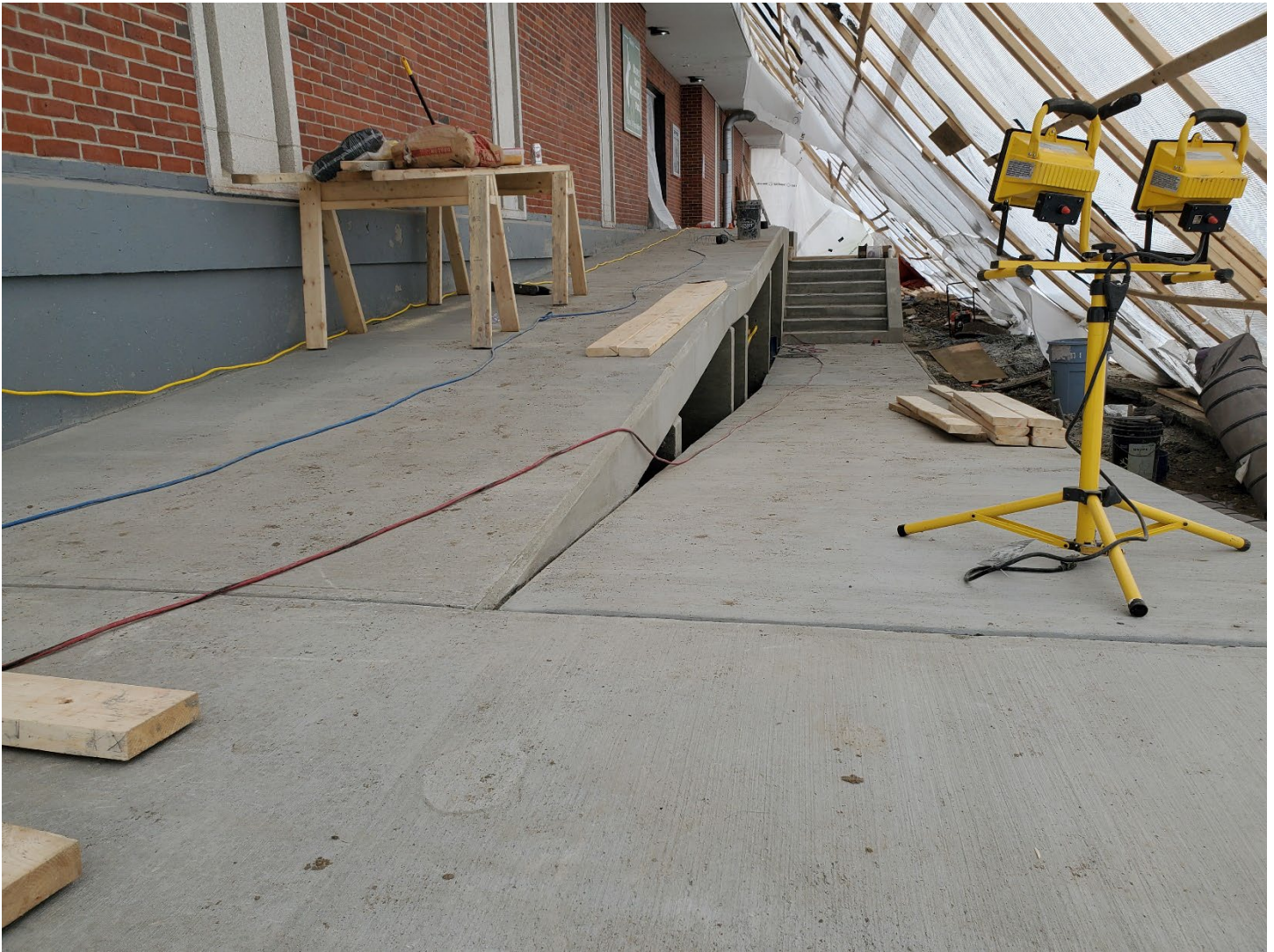
The new fully accessible main entrance is well underway. In the above image you can see the new accessible ramps are nearly complete.