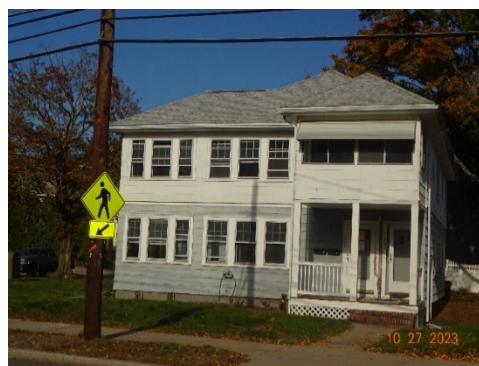
265-267 River St.

The purpose of this memorandum is to provide the City Council and the public with technical information and planning analysis which may be useful in the special permit decision making process of the City Council. The Planning Department's intention is to provide a balanced view of the issues with the information it has at the time of the public hearing. There may be other information presented at or after the public hearing that the Land Use Committee of the City Council will want to consider in its discussion at a subsequent Working Session.