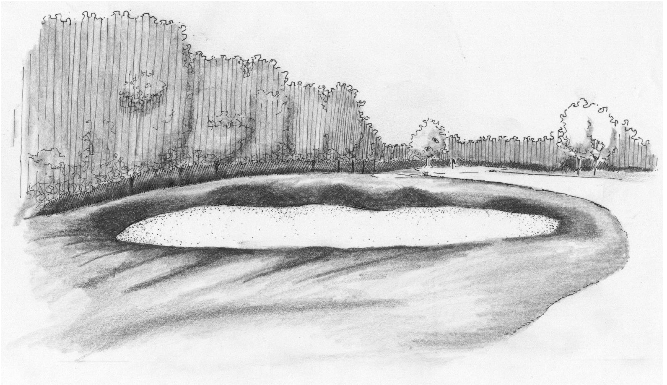
ROSS-NEWTON FAIRWAY BUNKER PERSPECTIVE