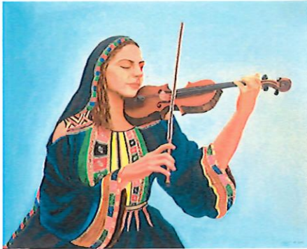
Love and Art