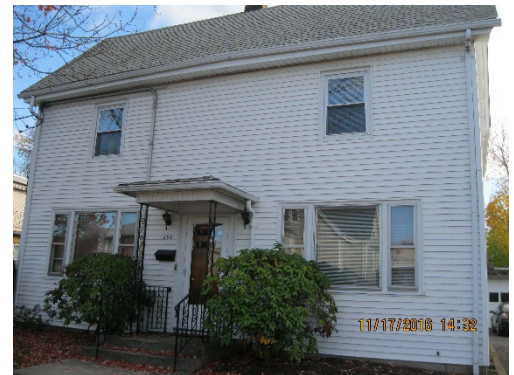
290 Watertown Street

The purpose of this memorandum is to provide the City Council and the public with technical information and planning analysis conducted by the Planning Department. The Planning Department's intention is to provide a balanced review of the proposed project based on information it has at the time of the public hearing. Additional information about the project may be presented at or after the public hearing for consideration at a subsequent working session by the Land Use Committee of the City Council.