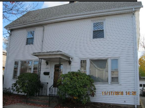
290 Watertown Street

The purpose of this memorandum is to provide the City Council and the public with technical information and planning analysis conducted by the Planning Department. The Planning Department's intention is to provide a balanced review of the proposed project based on information it has at the time of the public hearing. Additional information about the project may be presented at or after the public hearing for consideration at a subsequent working session by the Land Use Committee of the City Council.