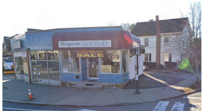
340 River Street

The purpose of this memorandum is to provide the City Council and the public with technical information and planning analysis which may be useful in the special permit decision making process of the City Council. The Planning Department's intention is to provide a balanced view of the issues with the information it has at the time of the public hearing. There may be other information presented at or after the public hearing that the Land Use Committee of the City Council will want to consider in its discussion at a subsequent Working Session.