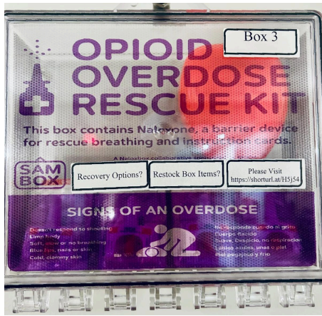
(Photo: An Opioid Overdose Rescue Kit outside the Mayor's Office on the second floor of City Hall.)

In Newton we will be using opioid settlement funds to purchase and place Opioid Overdose Rescue Kits which contain Naloxone (i.e. narcan) in public buildings around the City.