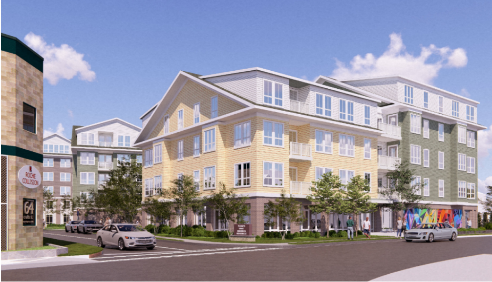
The 40B project at 78 Crafts Street on the

Newtonville/Nonantum border was submitted by Boylston Properties in December 2023, and the ZBA opened the public hearing on January 10, 2024. The ZBA subsequently held six additional hearings, and the developer made numerous revisions prior to the ZBA’s vote to approve the project with conditions on Wednesday evening. (The project materials and the ZBA decision (which will be issued next week) can be found here .)