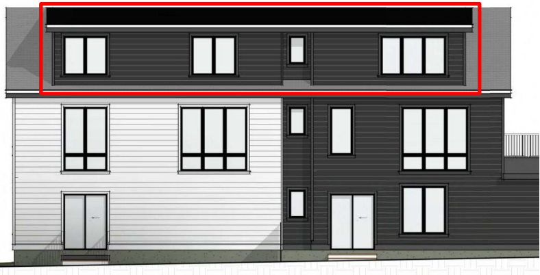
Fig. 2: Building elevation with shed dormer (red), not allowed by-right

Dormers are an important architectural feature that both helps to articulate the building and allows for habitable space on the upper floors while reducing the visual impression of the mass of the building. Dormers should be encouraged. Without dormers, many projects would opt for a flat roof, which is typically less expensive than a pitched roof. This is particularly true for the Multi-Residence Transit (MRT) district where that upper story must be habitable for the required third unit.