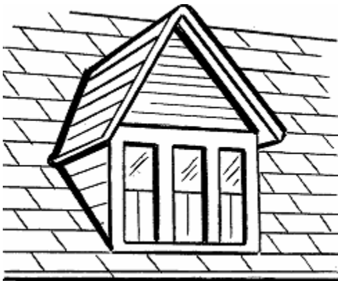
Fig. 1: Sketch of a typical dormer