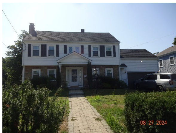
640 Watertown Street

The purpose of this memorandum is to provide the City Council and the public with technical information and planning analysis which may be useful in the special permit decision making process of the City Council. The Planning Department's intention is to provide a balanced view of the issues with the information it has at the time of the public hearing. There may be other information presented at or after the public hearing that the Land Use Committee of the City Council will want to consider in its discussion at a subsequent Working Session.