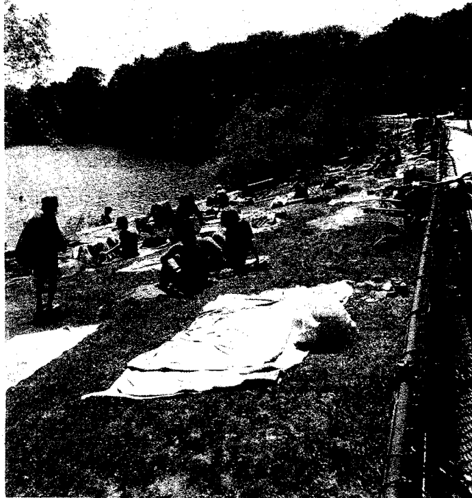
CRONIN COVE, JUNE 2011