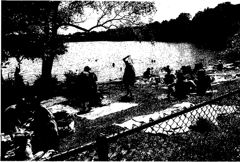
Costanza Attachment #2