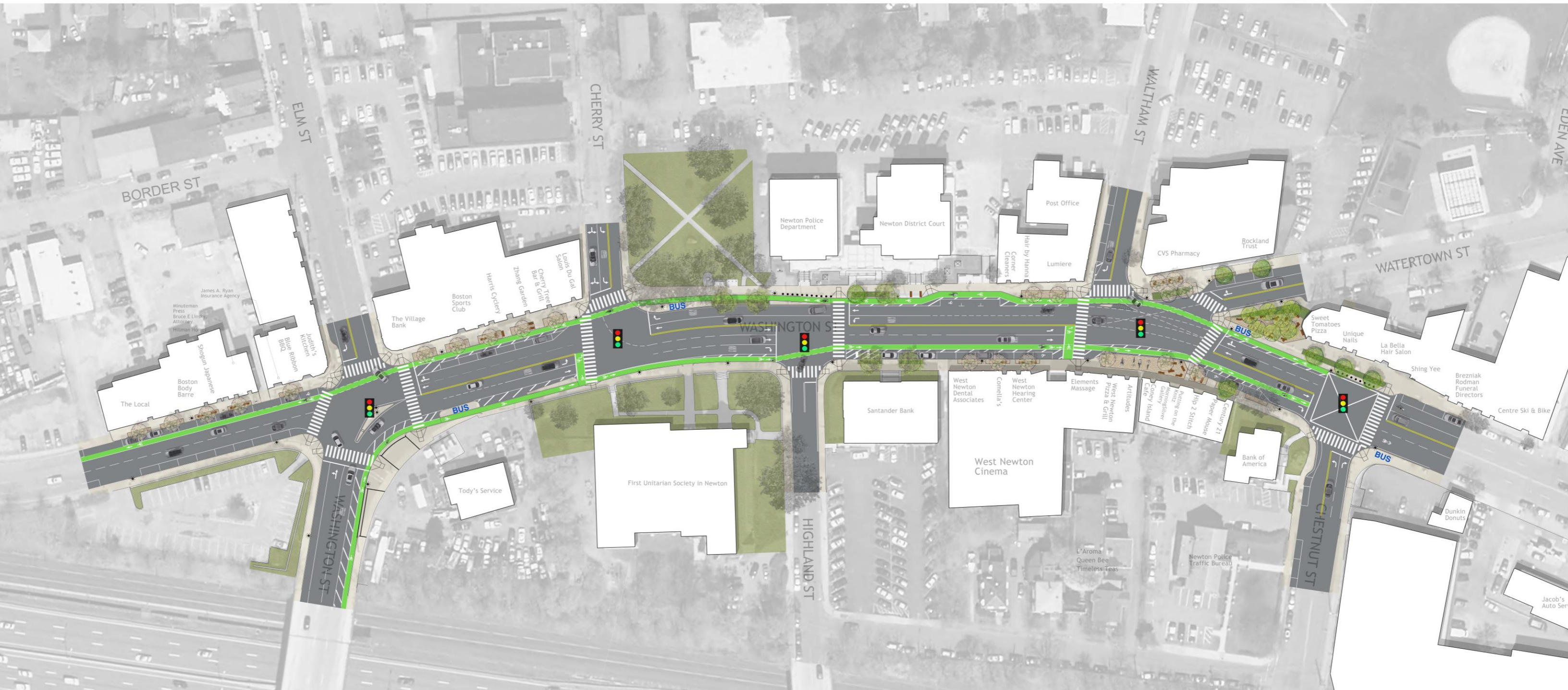
West Newton Square Enhancements Project