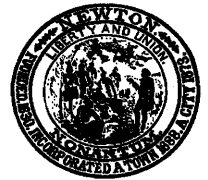
Setti D. Warren Mayor

1164 Centre Street, Newton Center, MA 02459-1584 Chief: (617) 796-2210 Fire Prevention: (617) 796-2230 FAX: (617) 796-2211 EMERGENCY: 911