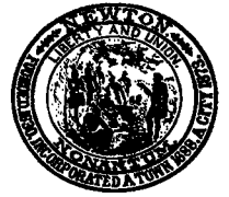
Setti D. Warren Mayor

1164 Centre Street, Newton Center, MA 02459-1584 Chief: (617) 796-2210 Fire Prevention: (617) 796-2230 FAX: (617) 796-2211 EMERGENCY: 911