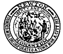
Setti D. Warren Mayor

1164 Centre Street, Newton Center, MA 02459-1584 Chief: (617) 796-2210 Fire Prevention: (617) 796-2230 FAX: (617) 796-2211 EMERGENCY: 911