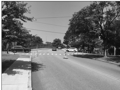
Lowell Ave - Traveling Northbound