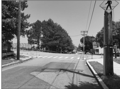
Austin Street - Traveling Eastbound