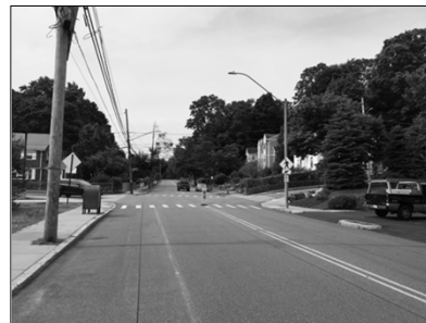
Lowell Ave - Traveling Southbound