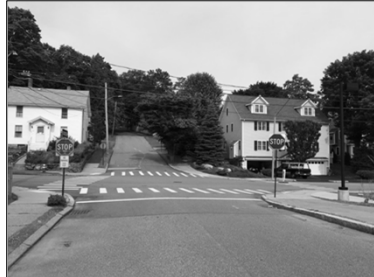
Hull Street - Traveling Westbound