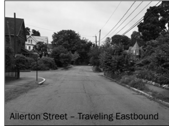
Allerton Street – Traveling Eastbound