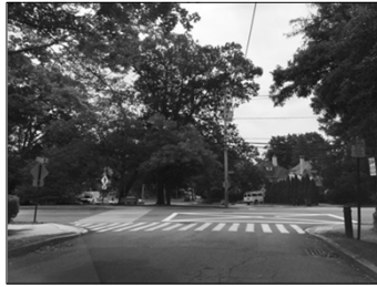
Cushing Street – Traveling Southbound