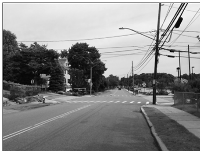
Lowell Ave - Traveling Northbound