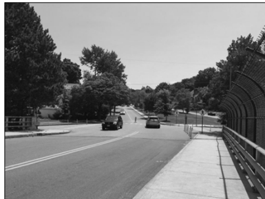
Lowell Ave - Traveling Southbound