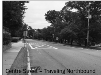
Centre Street – Traveling Northbound