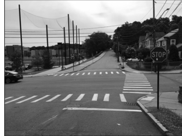
Highland Street - Traveling Eastbound