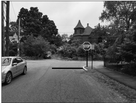
Cushing Street – Traveling Northbound