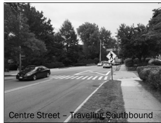
Centre Street – Traveling Southbound