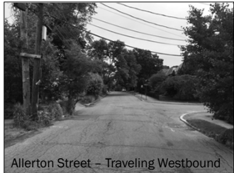
Allerton Street – Traveling Westbound