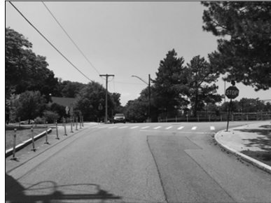
Austin Street - Traveling Westbound