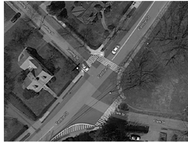
Cushing Street - Traveling Southbound