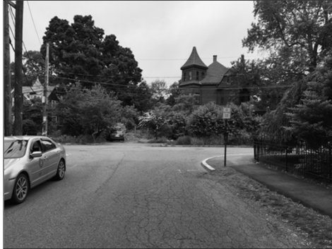
Cushing Street – Traveling Northbound