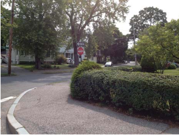
Walker St., at intersection