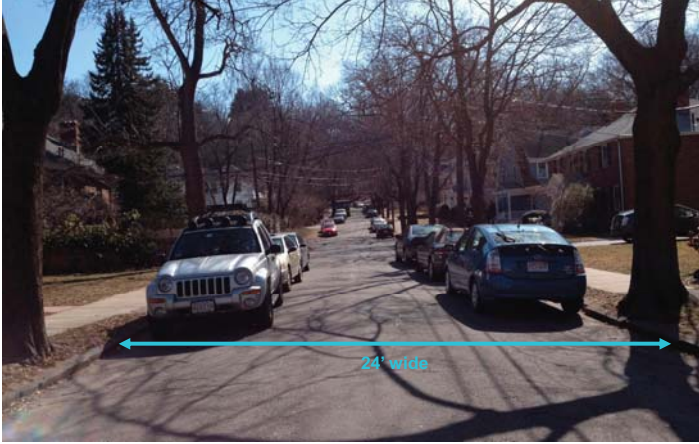
Gay Street prior to 3/15/12