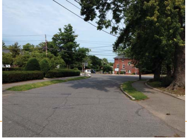
Page Road approach