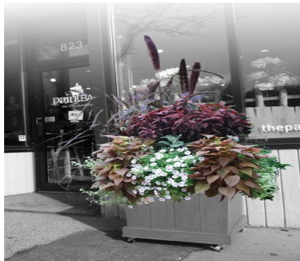
Beautiful Newtonville Planter Sketch

Plans to widen the sidewalks and repave Walnut Street have been pushed back one year. Parts of Walnut Street up to Cabot Street have been repaved but the Newtonville portion will begin this spring. Members have written to the mayor to express opposition to the idea of angled parking and widening only one side of the street. The council supports widening both sides. With the help of landscape architect Natalie Adams the council has presented the city with a concept for the renovation with regards to choice and placement of lighting, trees, and benches.