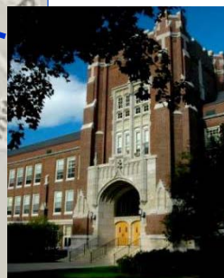
view from Allerton Road

PUBLIC PARKING on surrounding streets and at tennis courts off Rowena Road