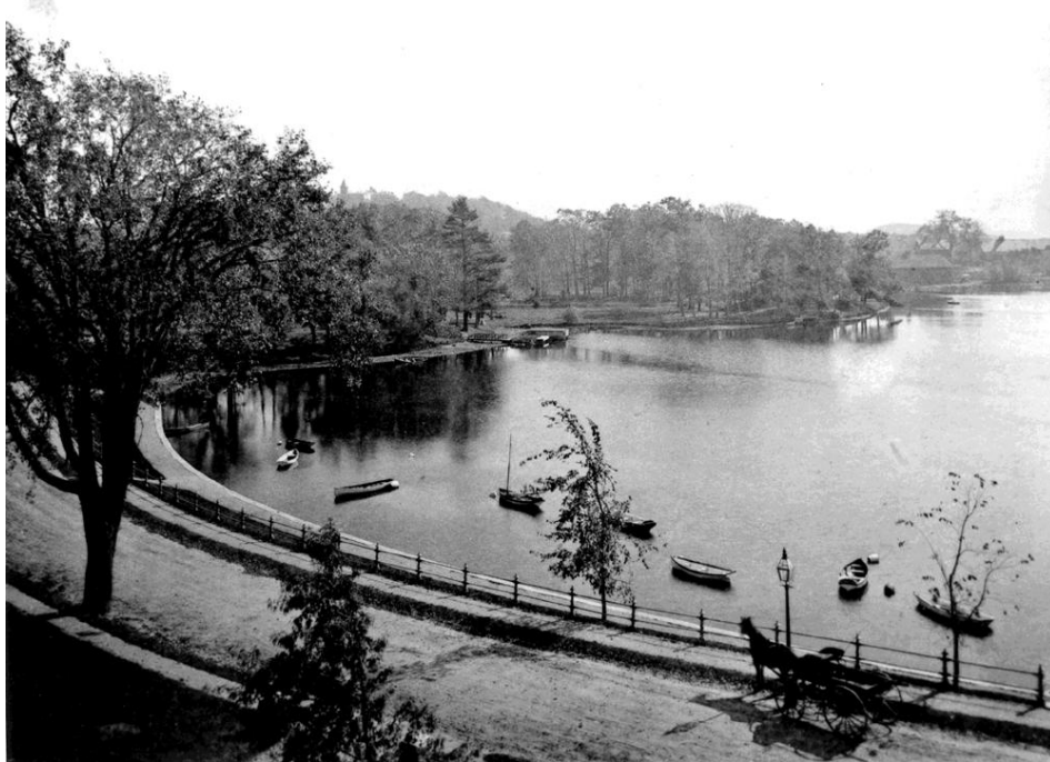
Cronin's Cove Crystal Lake 1888

Use of Crystal Lake for boating and fishing is permitted year-round from dawn to dusk subject to the following rules and regulations: