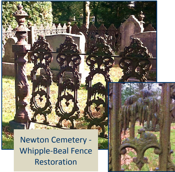
Newton Cemetery - Whipple-Beal Fence Restoration