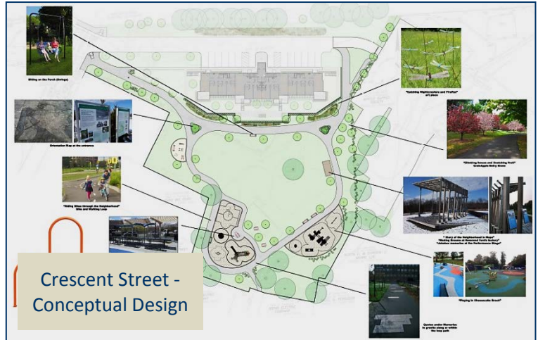
Crescent Street - Conceptual Design