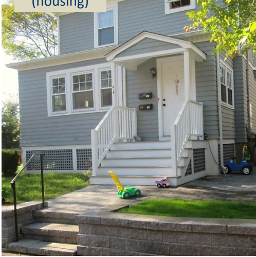
Taft Avenue (housing)