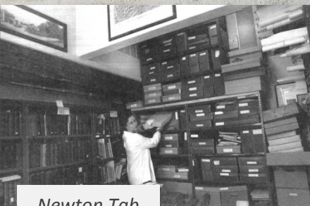
Newton Tab May 18, 2005