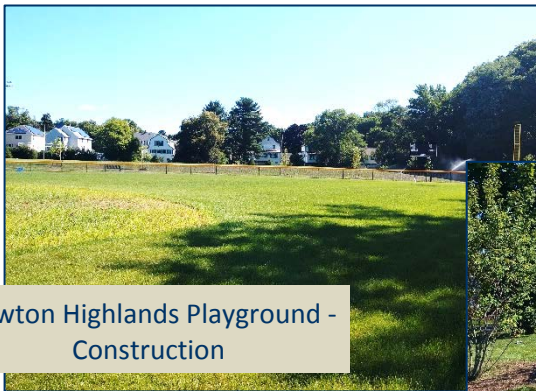
Newton Highlands Playground - Construction