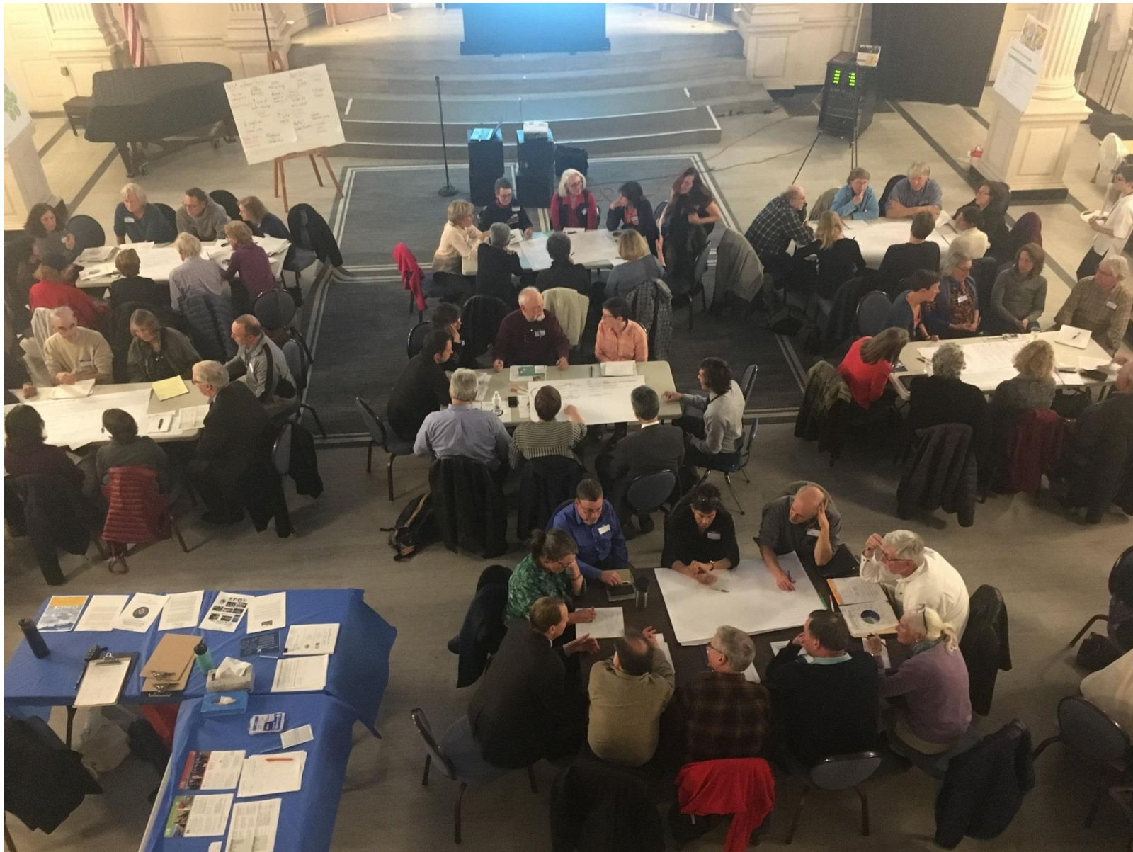
All of our small groups working hard and coming up with some great ideas!