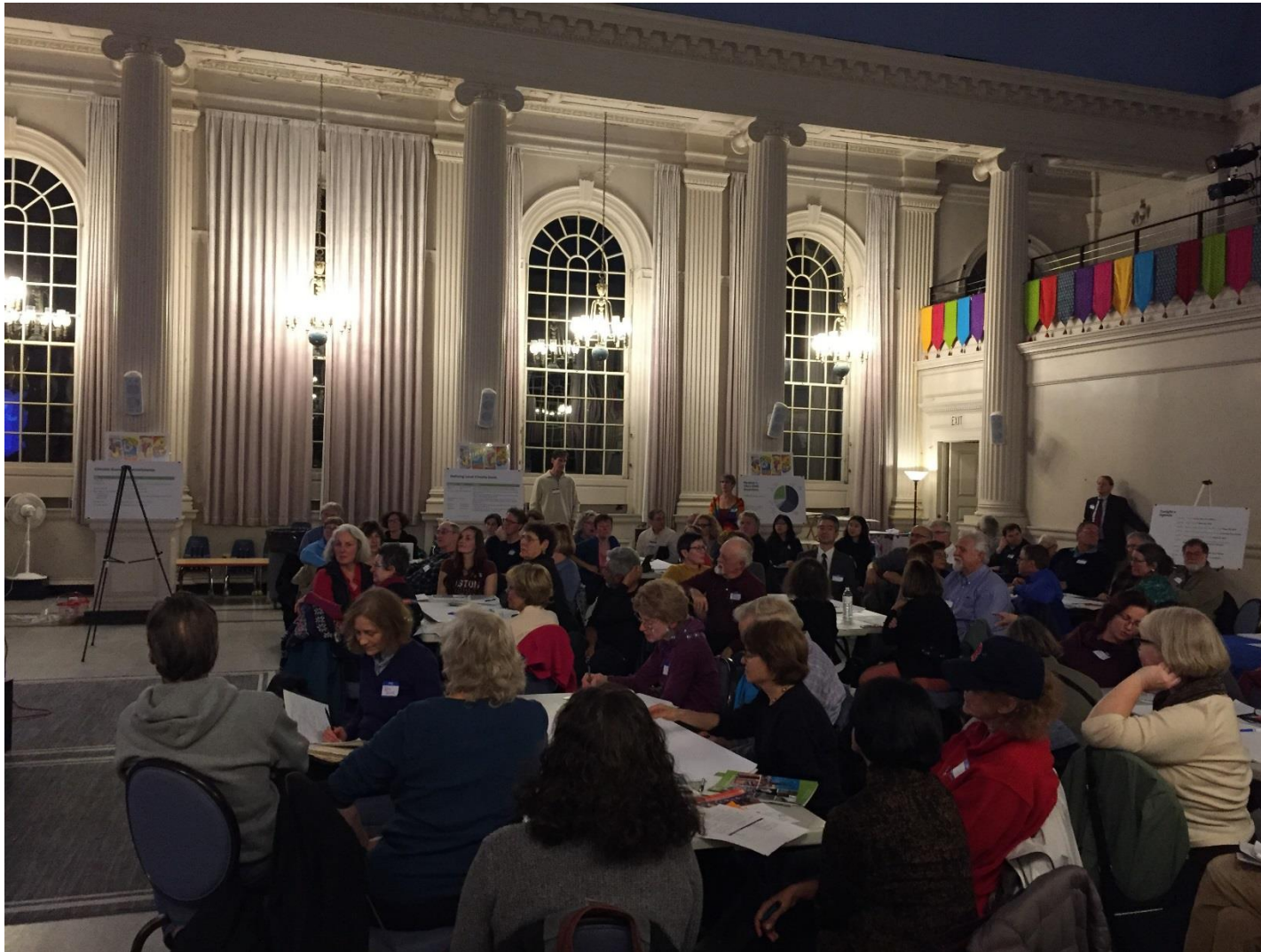
A full house for our Kick-off Roundtable Discussion for the Climate Action Plan!