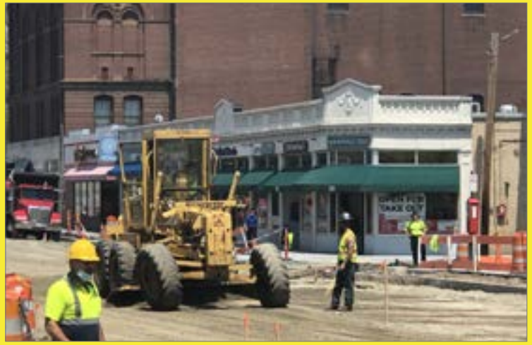
Milling and paving Walnut Street.