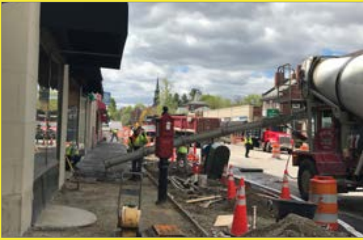
Widening and pouring sidewalks on the East side of Walnut Street.