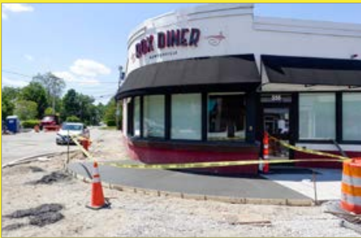
New wider sidewalk in front of Rox Diner.