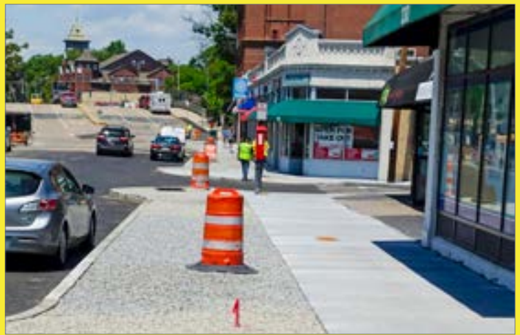
New wider sidewalks in front of Los Amigos and Natural Sense.