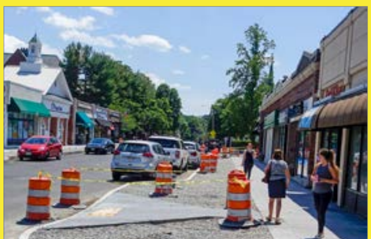
New wider sidewalks on Walnut Street (West side).