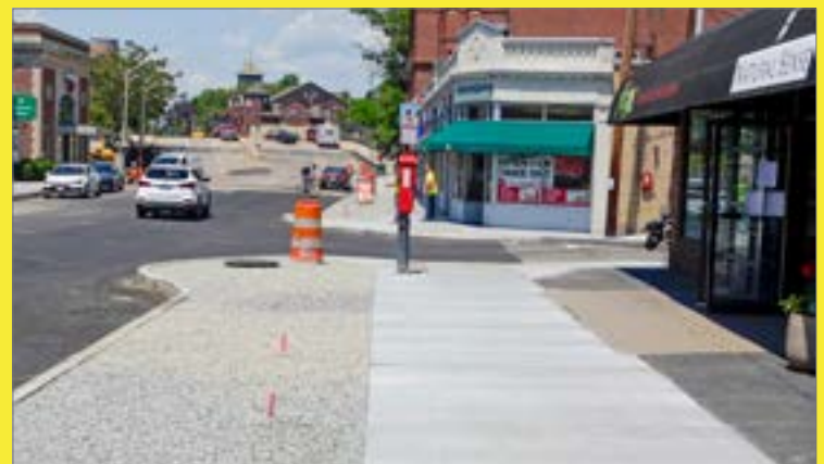
New wider sidewalks on Walnut Street (East side).

Widest possible sidewalks in the Village Center; two major pedestrian crossings at intersection of Walnut & Austin Street and Walnut Street & Highland Avenue; simplified intersection at Walnut & Austin Street and Walnut St. & Newtonville Ave.